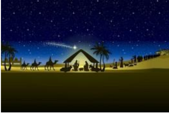
Christmas Day December 25, 2016

<u>TO OUR VISITORS</u> – We welcome you to St. Mary's today. Please consider joining us in the Fellowship Hall for refreshments. We hope you enjoyed your time with us and plan on worshipping with us again.