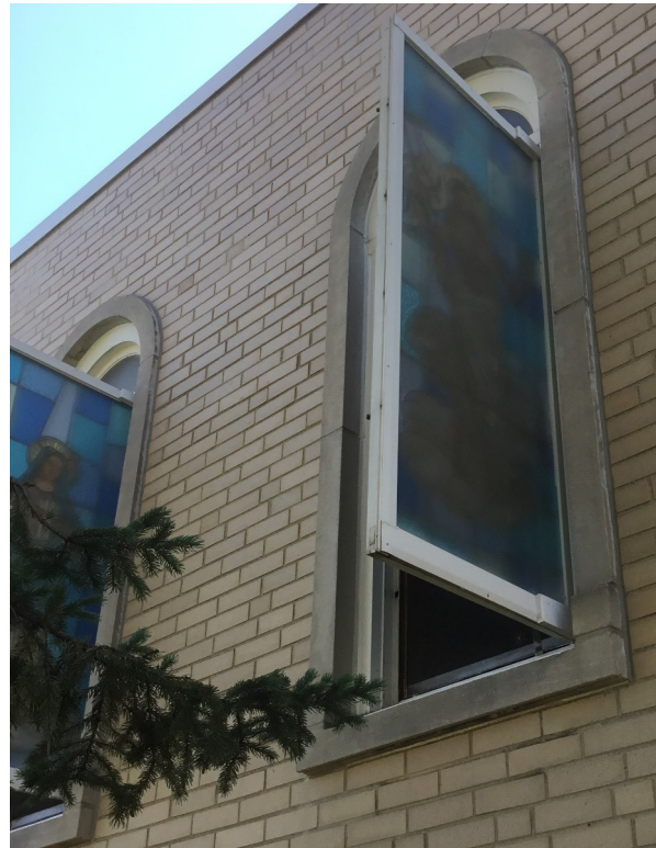
Above: Notice the sludged look of the plastic protective coating and erosion of the wooden frames. Below: Clear and bright: translucent yet almost reflective, beautifully colored and repaired wooden frames.

I truly hope you have had the chance to look at our beautifully restored windows. If not I hope you will take the time if at all possible. The before and after pictures give you some idea of